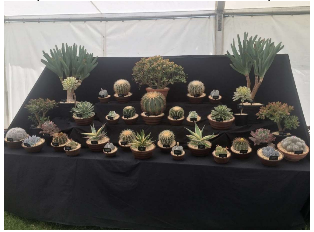
Oxford Branch display at Blenheim

Members of the Branch attended the three-day flower show again this year and staged a mixed display in the floral marquee. We thought that it was one of the best displays we had done but sadly 'no cigar': the judges marked us down on a couple of points; however, we still managed to achieve a Silver Gilt award for our stand. We were very well situated near one of the main entrances to the floral marquee and had lots of positive comments from visitors and other exhibitors about the stand. This is an ideal venue for us as a Branch and an event at which to publicize our hobby to the general public. We spoke to a large number of visitors to the show and handed out lots of cultivation information leaflets in the hope that it would attract some interest in our Branch Show in July.